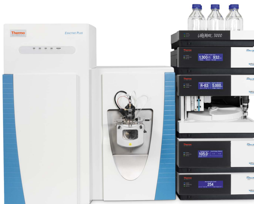
Exactive Plus mass spectrometer with Thermo Scientific™ Dionex™ UltiMate™ 3000 Rapid Separation LC system